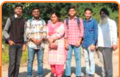
Visit to Kanail