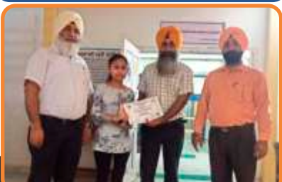
Inter school fest