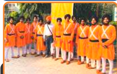
Khalsayi Khed Utsav 2021