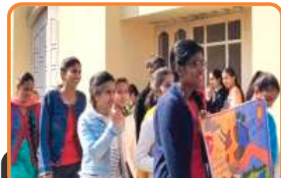
Rally on Wetland Day