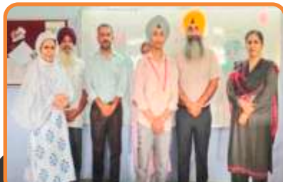
Ozone layer Day